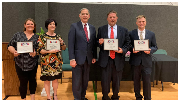
Arkansas Senator John Boozman congratulates adult drug and veterans treatment court graduates in Benton County, AR.

Consider asking your graduates and participants to send letters of appreciation as well.