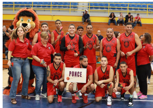
National Treatment Court Month basketball tournament in Puerto Rico.

DWI courts make our streets safer and are working to end impaired driving by addressing the root of the problem: addiction. May is #TreatmentCourtMonth, and we're celebrating that when one person rises out of addiction and crime, we all rise!