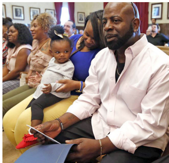
An adult drug treatment court graduate celebrates with his family in Cleveland County, Oklahoma

We're celebrating the lifesaving work of DWI courts across the country the entire month of May. Every day, these programs make our roads and communities safer while providing accountability and treatment to help repeat impaired drivers get back on track. Because when one person rises out of addiction, we all rise. #TreatmentCourtMonth