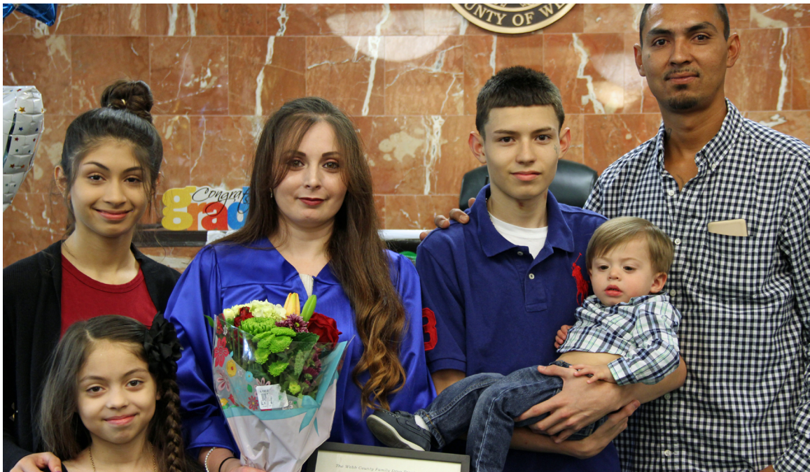
A family treatment graduate and her family in Texas.