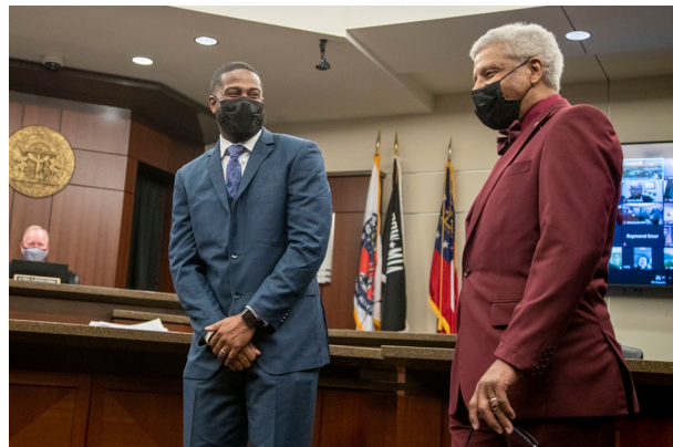
Veterans treatment court graduation in Cobb County, Georgia.

Give them an award. If your members of Congress or other elected officials have been particularly vocal and public in their support of treatment courts, present them with an award acknowledging their leadership on issues of public health and public safety. This is a great way to entice them to attend your graduation ceremony or other event!