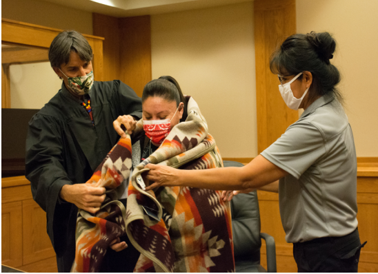
TuuCai Wellness Court graduation.

This National #TreatmentCourtMonth, [court] joins 4,000+ treatment courts across the country to celebrate leading people out of the justice system and into long-term recovery! Because when one person rises out of addiction, we all rise.