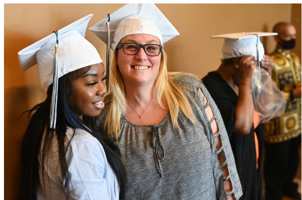
Adult drug treatment court graduates in Michigan.

We want to amplify your success at the national level! Tell us how your program is celebrating National Treatment Court Month: Submit your media coverage, event photos, proclamations, videos, and more here.