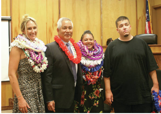
Treatment court graduation in Hawaii.

This Nat'l #TreatmentCourtMonth, [court] joins 4,000+ treatment courts across the U.S. to celebrate leading people out of the justice system and into long-term #recovery!