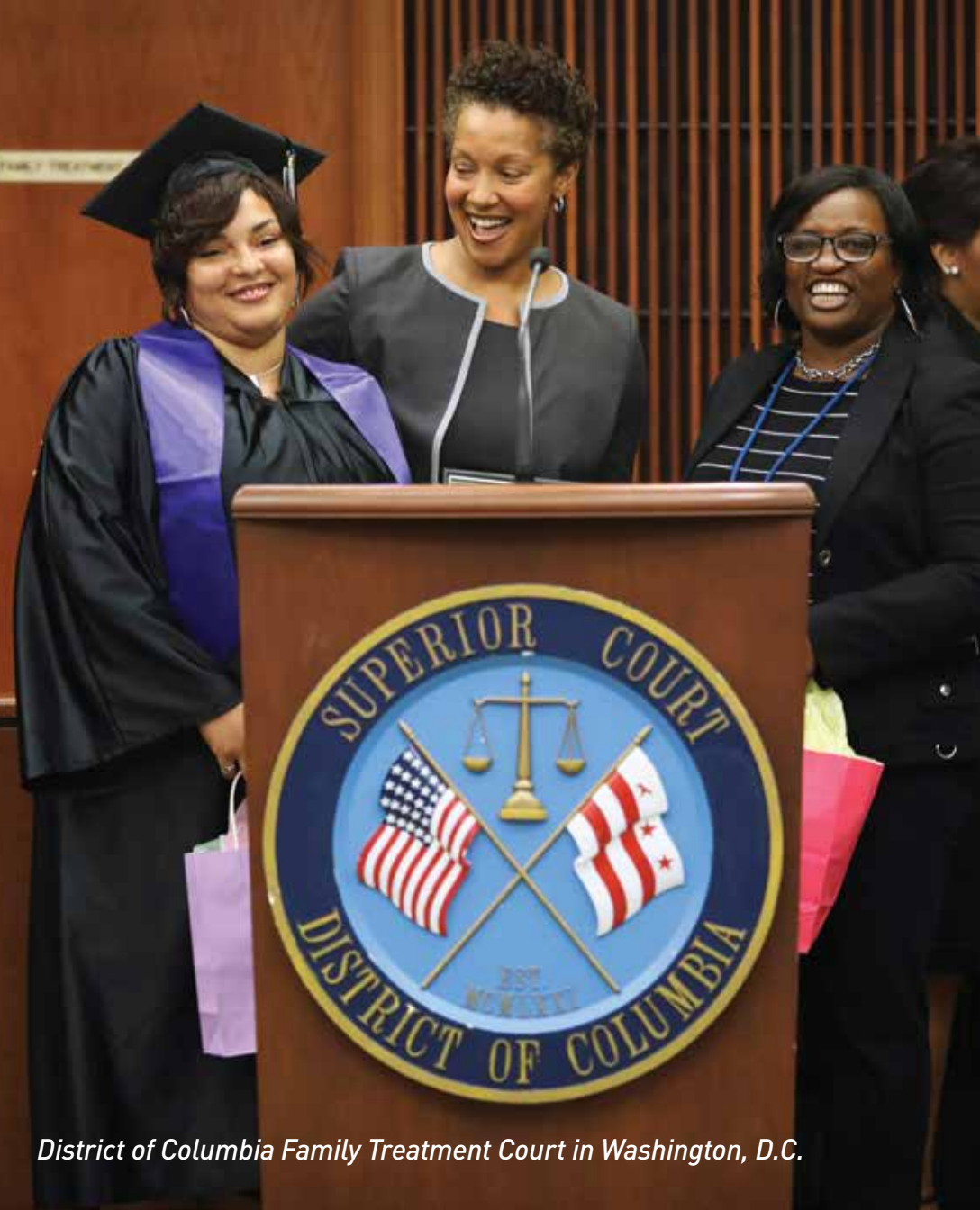
District of Columbia Family Treatment Court in Washington, D.C.