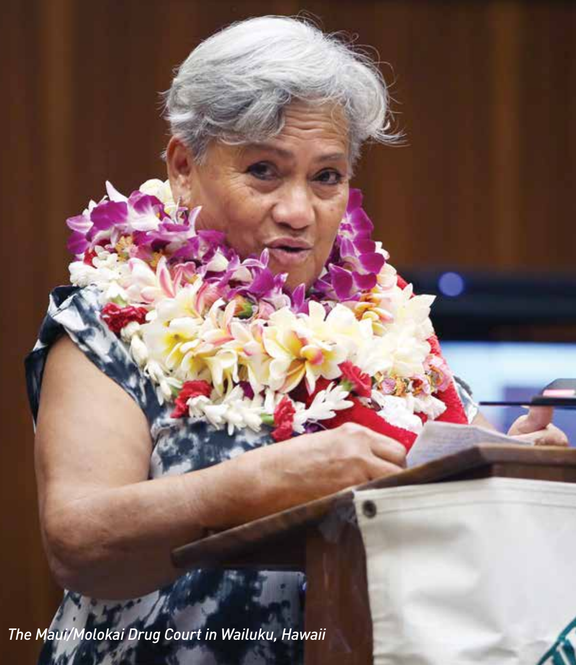
The Maui/Molokai Drug Court in Wailuku, Hawaii

Treatment courts provide recovery support by addressing social requirements such as education, employment, housing assistance, family reunification, restitution, and healthcare.