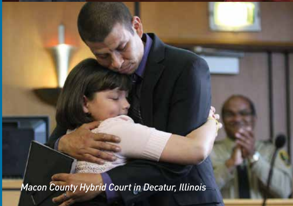
Macon County Hybrid Court in Decatur, Illinois