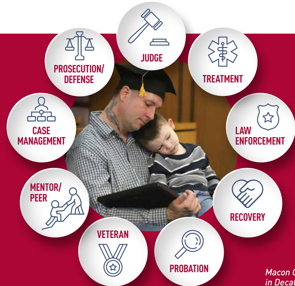
Macon County Hybrid Court in Decatur, Illinois

WE ARE 40,000 justice and treatment professionals on the front lines of the addiction epidemic.