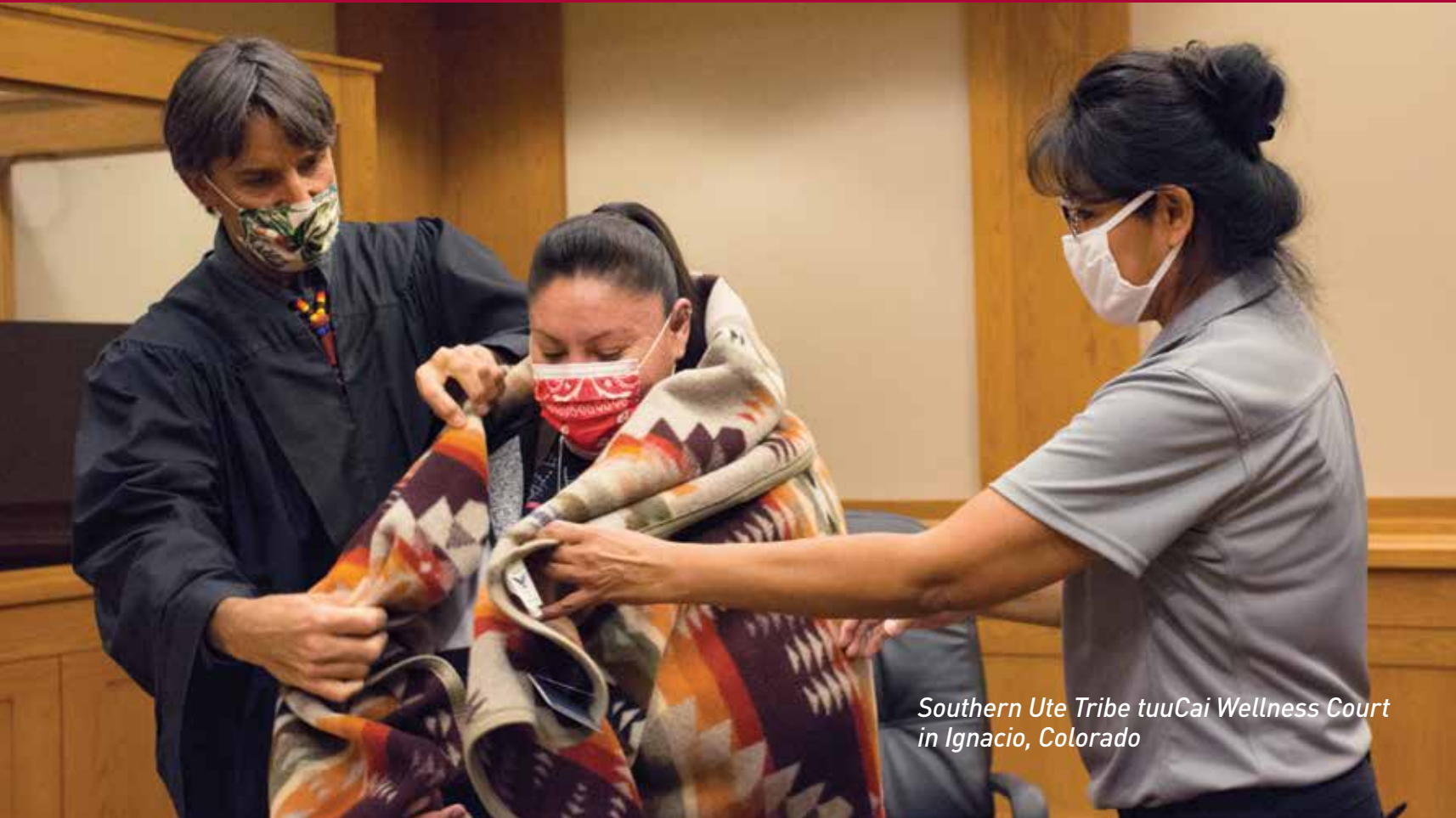
Southern Ute Tribe tuuCai Wellness Court in Ignacio, Colorado

WE ENSURE a public health response to addiction and mental illness in the justice system.