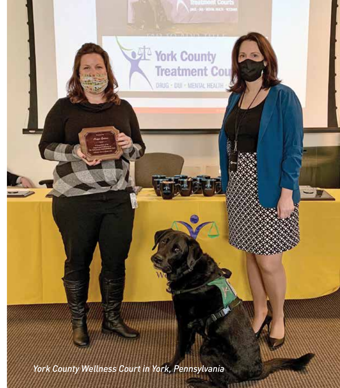
York County Wellness Court in York, Pennsylvania

→ We KEEP FAMILIES TOGETHER and break generational cycles of addiction.