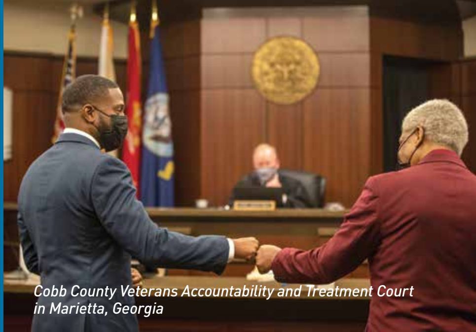
Cobb County Veterans Accountability and Treatment Court in Marietta, Georgia

Treatment courts have led nearly 1.5 million people to a path of long-term recovery.