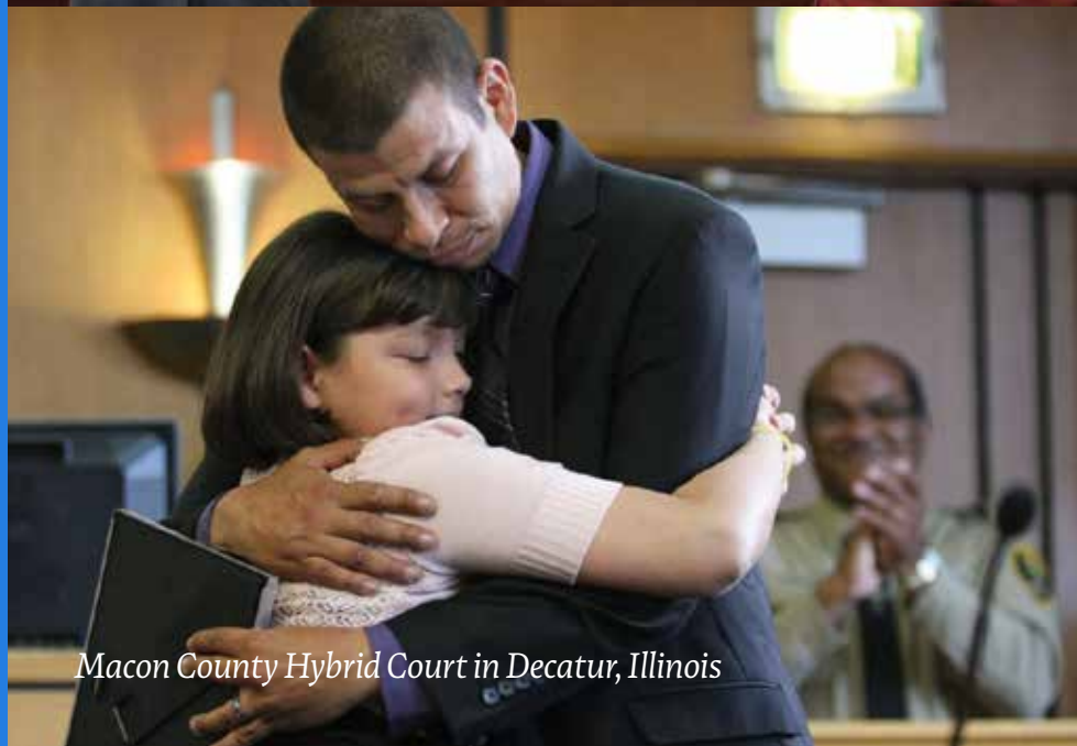
Macon County Hybrid Court in Decatur, Illinois