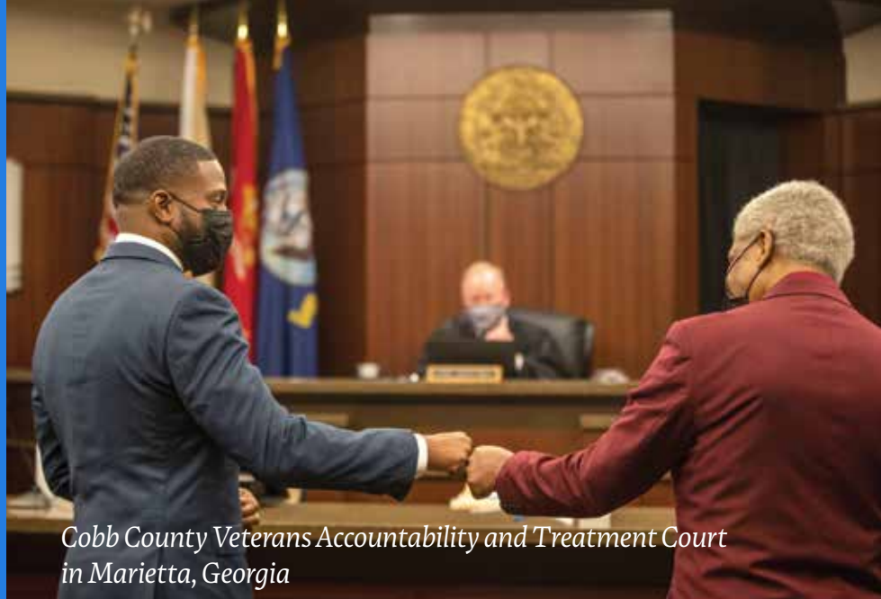
Cobb County Veterans Accountability and Treatment Court in Marietta, Georgia

They are mothers and fathers, sons and daughters, friends and neighbors, and their lives are worth saving.