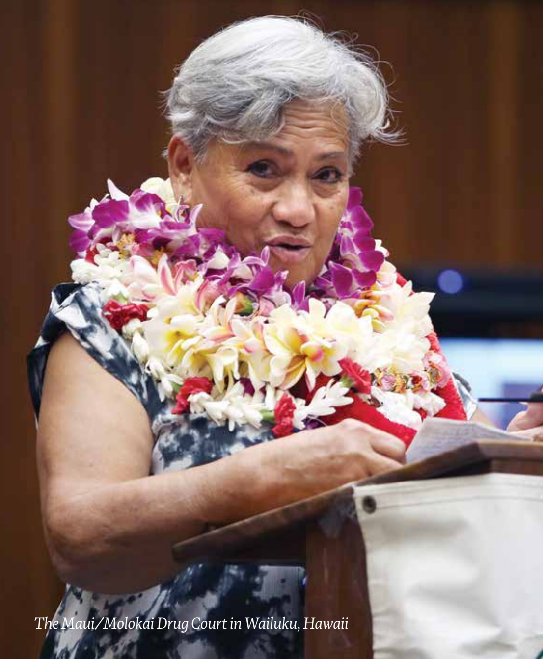
The Maui/Molokai Drug Court in Wailuku, Hawaii

Treatment courts provide recovery support by addressing social requirements such as education, employment, housing assistance, family reunification, restitution, and healthcare.