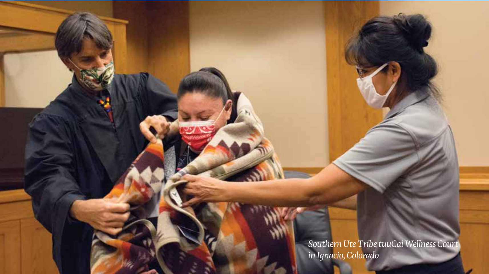
Southern Ute Tribe tuuCai Wellness Court in Ignacio, Colorado