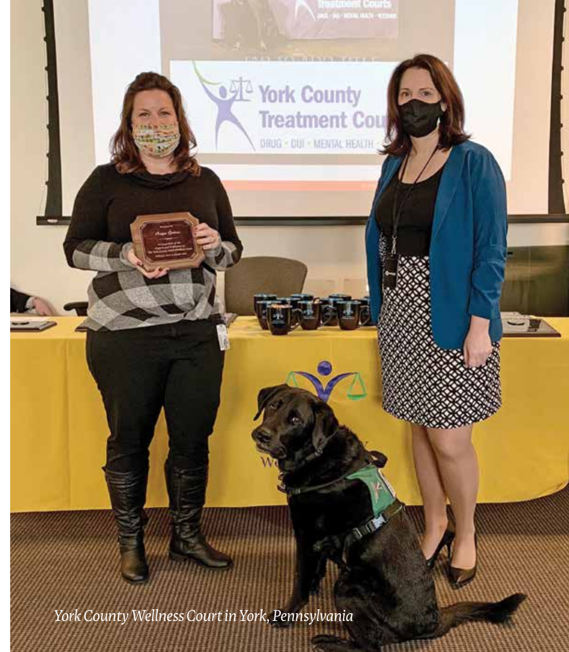
York County Wellness Court in York, Pennsylvania

→ We KEEP FAMILIES TOGETHER and break generational cycles of addiction.